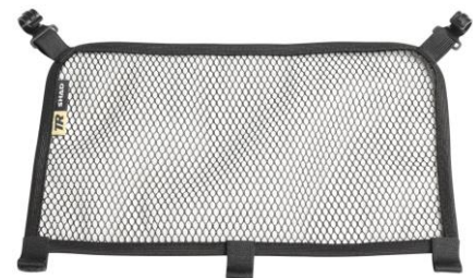
Inner mesh X0TR01 One included with right hand side case