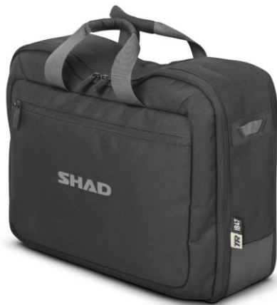
Inner bag X0IB47