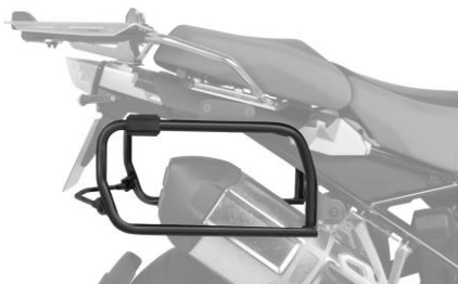
Specific 4P fittings